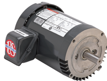
Steel Edge™ Motors C-Face Footless