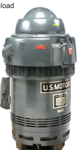
WPI 15-5000 HP and WPII 300-5000 HP